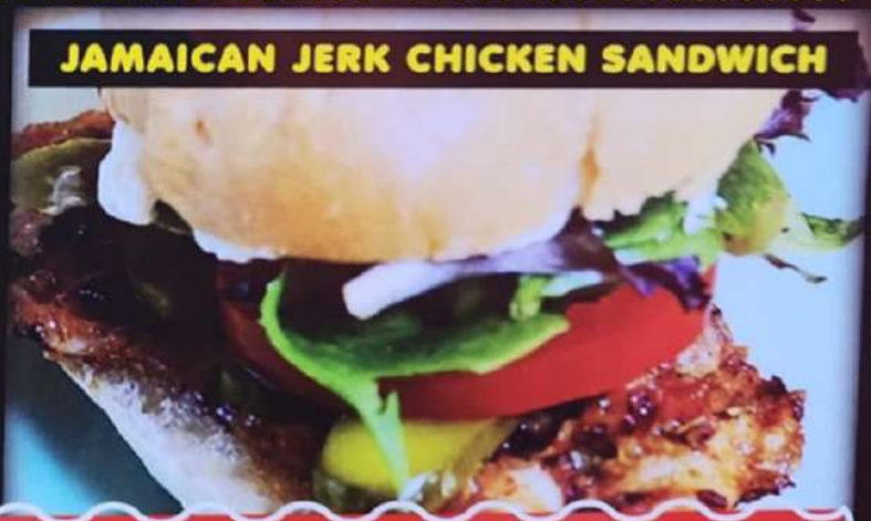
JAMAICAN JERK CHICKEN SANDWICH

Lunch Special!! 2 SLICES + FOUNTAIN DRINK ONLY $5 Plus Tax • 11am - 2pm Only